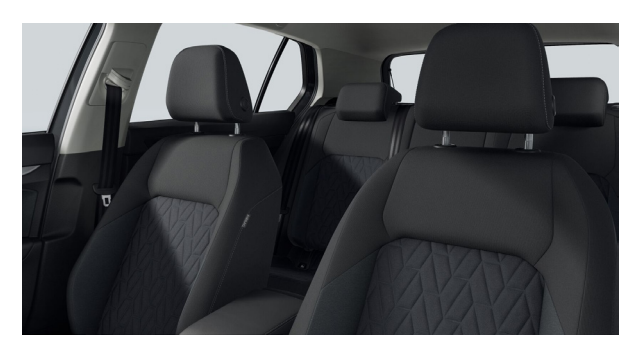
'Nature Cross' cloth Soul Black (BD) Standard on Life and Launch Edition