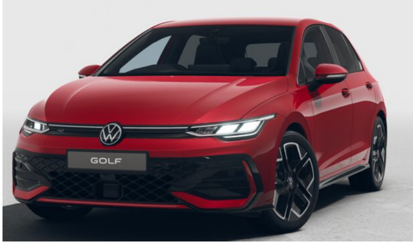
Note: The above image displays colour Kings Red Metallic