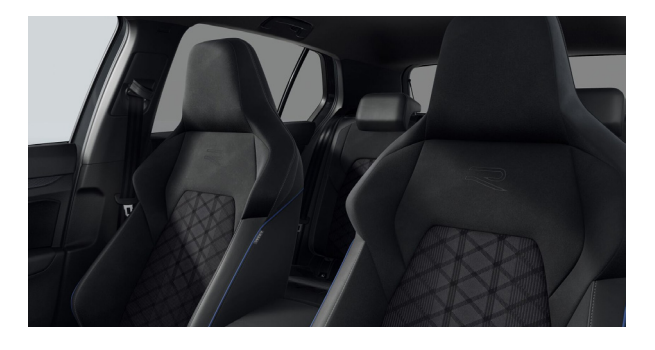
'R-Line' cloth Anthracite (IR) Standard on R-Line models

* Optional at extra cost. Please note, the print processes do not allow exact reproduction of the upholstery colours.