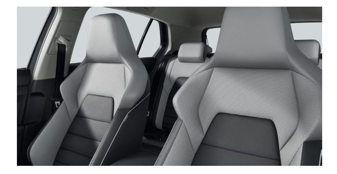
'Vienna' Leather WL3 Pack Soul (BD) Option on Style models Note: Not availabe on DA14BM