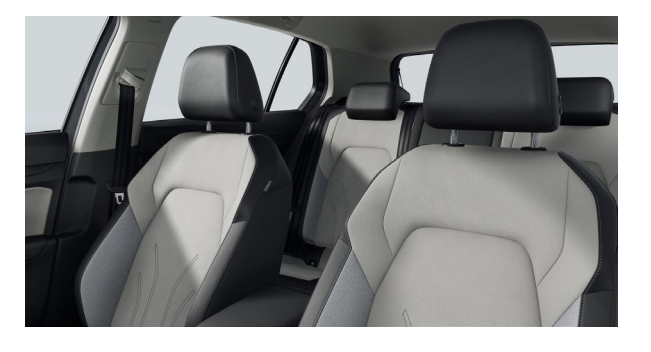
'Mistral' cloth Storm Grey (CR) Optional on Style models