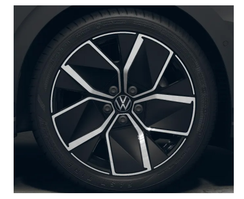
STANDARD ON EDITION 50 Optional on Style and R-Line 18" Leeds Alloy Wheel 7.5J x 18 Tyres: 225/40 R18