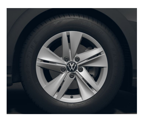
STANDARD ON LIFE 16" Norfolk alloy wheels 7J x 16 Tyres: 205/55 R16

The addition of optional extras may result in the vehicle increasing in Co2 g/km and therefore, attracting a higher rate of VRT than described in this product guide. For your exact configuration value, both Co2 g/km and RRP, please visit volkswagen.ie configurator.