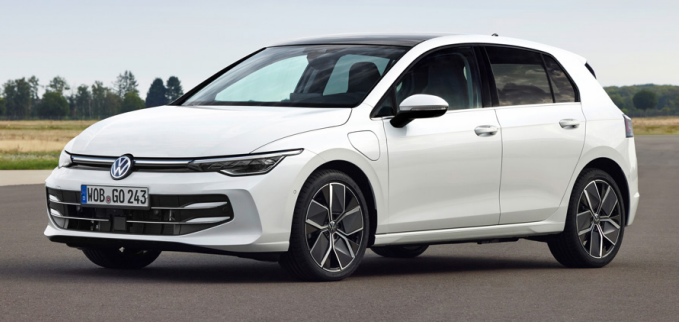
Note: The above image displays the optional 18" Leeds Alloy Wheel