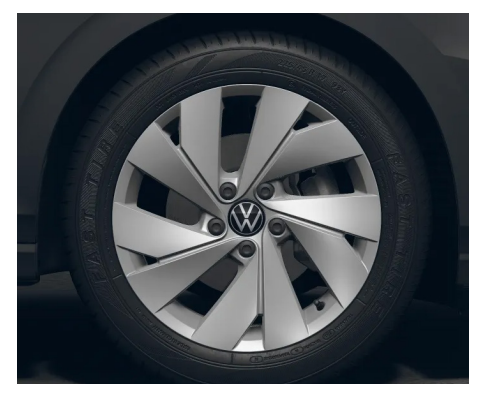
STANDARD ON LAUNCH EDITION & STYLE Optional on Life 17" Nottingham alloy wheels 7.5J x 17 Tyres: 225/45 R17