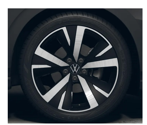
OPTIONAL ON STYLE 18" Catania Alloy Wheel 7.5J x 18 Tyres: 225/40 R18

The addition of optional extras may result in the vehicle increasing in Co2 g/km and therefore, attracting a higher rate of VRT than described in this product guide. For your exact configuration value, both Co2 g/km and RRP, please visit volkswagen.ie configurator.