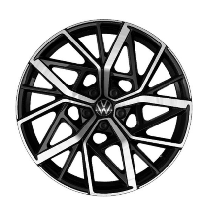
20" "Cannes", Black, diamond-turned