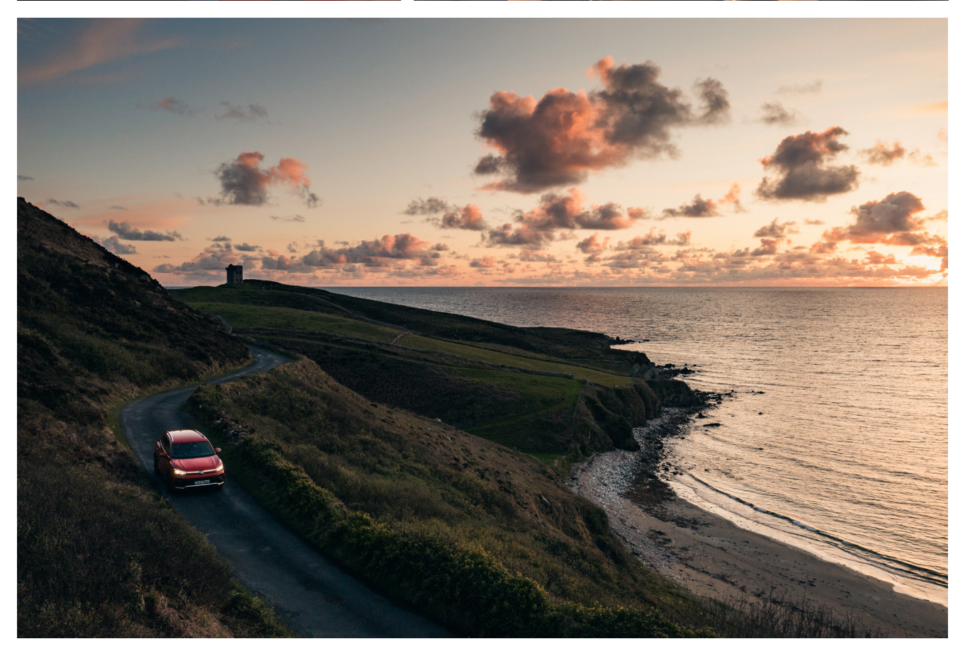
The above specifications are for information purposes only as our products are continually updated and changes may be made to the specifications at any time. If you require any specific feature, you must consult your local dealer who is regularly updated with any change in specification. Specifications are subject to change without notice.