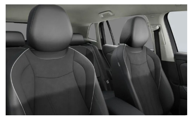
Soul Black Cloth Soul Black / Ceramique (AP) Standard – Elegance