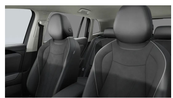
The above specifications are for information purposes only as our products are continually updated and changes may be made to the specifications at any time. If you require any specific feature, you must consult your local dealer who is regularly updated with any change in specification. Specifications are subject to change without notice.