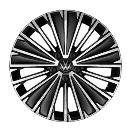
"Napoli" 18, Black Black, Diamond Turned