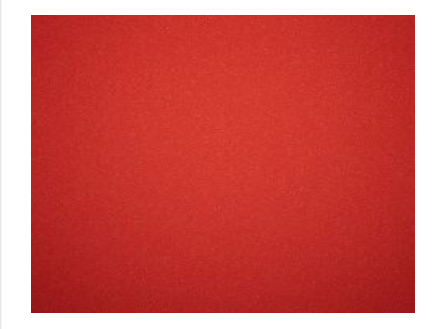
Persimmon Red Metallic*