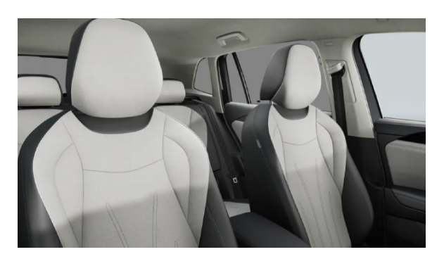
Mistral Grey Cloth Soul Black / Ceramique (AQ) Optional - Elegance