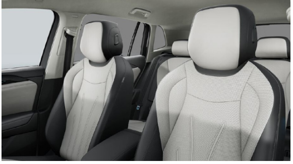
Mistral Grey - Varenna Leather (Package WL1) Soul Black (AQ) Optional - Elegance