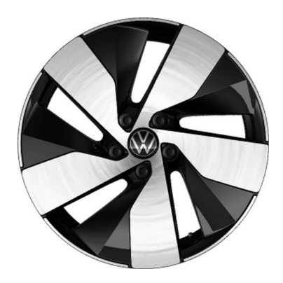
18" "Bologna", Black, Diamond Turned