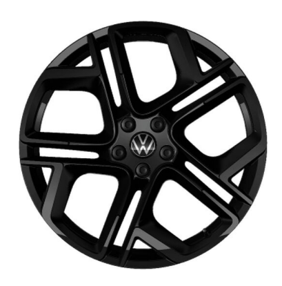
20" "York", Black Volkswagen R

The addition of optional extras may result in the vehicle increasing in Co2 g/km and therefore, attracting a higher rate of VRT than described in this product guide. For your exact configuration value, both Co2 g/km and RRP, please visit volkswagen.ie configurator.