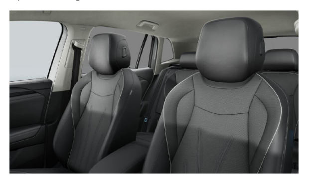
Soul Black - Varenna Leather (Package WL1) Soul Black (AP) Optional - / Launch Ed / Elegance