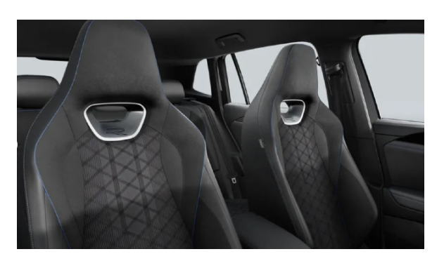
"R-Line" Cloth Soul Black (ZN) Standard – R-Line & R-Line 75