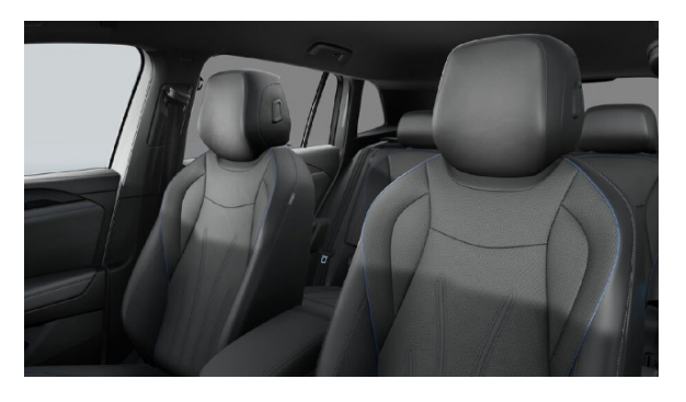
Soul Black - Varenna Leather (Package WL1) Soul Black (ZN) Optional - / R-Line & R-Line 75