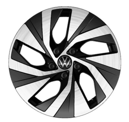
"Venezia" 17, Black, Diamond Turned

The addition of optional extras may result in the vehicle increasing in Co2 g/km and therefore, attracting a higher rate of VRT than described in this product guide. For your exact configuration value, both Co2 g/km and RRP, please visit volkswagen.ie configurator.