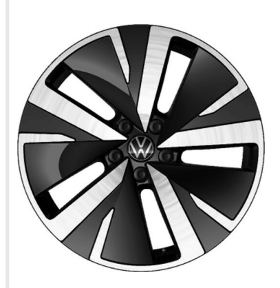
19" "Catania", Black, Diamond Turned